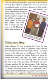
"LEADERSHIP FOR A HEALTHY ARIZONA"