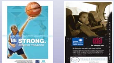
"LEADERSHIP FOR A HEALTHY ARIZONA"