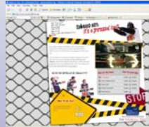
"LEADERSHIP FOR A HEALTHY ARIZONA"